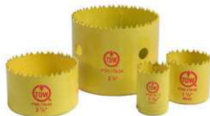
■ Hole Saw (various sizes)

The TD-XX or TD-1XX Drilling Machine is a manual or power-driven machine which taps into pipe while under pressure. It is used for making taps on 1/2- through 2-inch (DN 13 - DN 50) pipe without shutdown. It can be used to install 3/4- through 2-inch completion plugs in tapping nipples to permit recovery of tapping valves and to install TDW PIG-SIG ® Scraper Passage Indicators.