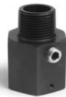
■ 1-inch Threaded Adapter

Note: Boring bar length also varies with adapter type. Drill is recessed with 1-inch NPT male adapter (Model TD-XX), resulting in no separate adapter required when used with a 1-inch NPT valve.