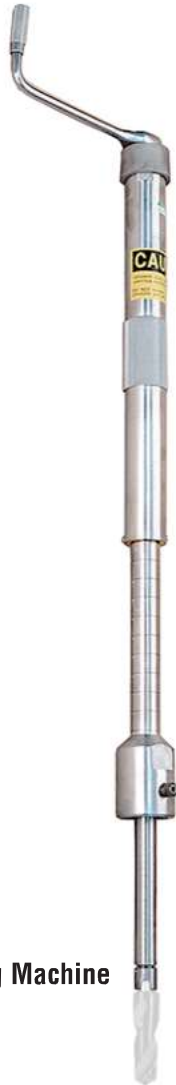
■ T-101 Drilling Machine Model T-101B