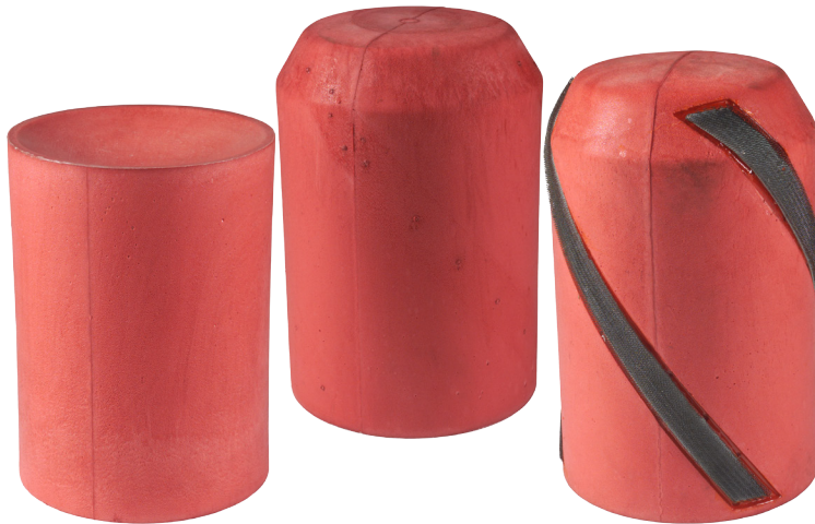
■ REDSKIN™ Foam Pigs

Bulletin No: 3020.001.02 Date: January 2007 Cross Indexing No: n/a Supersedes: 3020.001.01 (2/00)