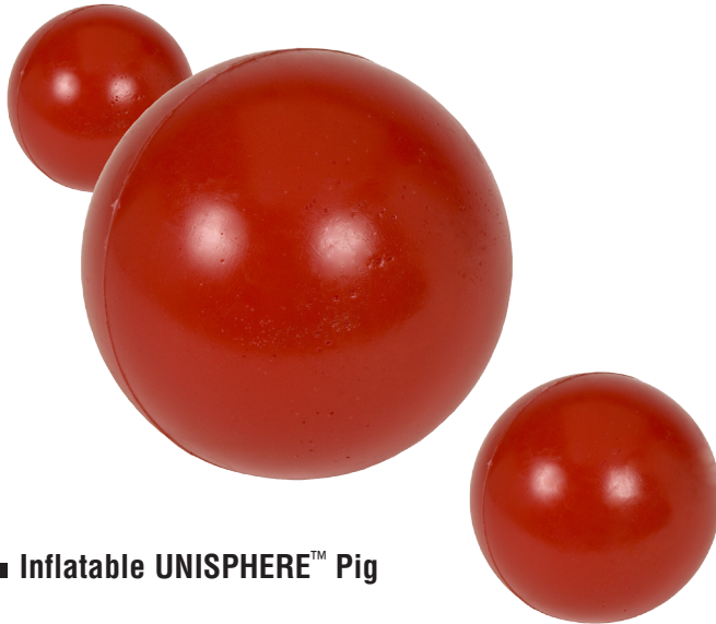
■ Inflatable UNISPHERE™ Pig

Bulletin No: 3010.001.02 Date: January 2007 Cross Indexing No: n/a Supersedes: 3010.001.01 (2/05)